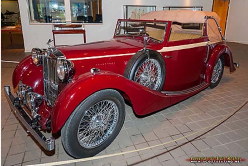
1937 MG VA at Owls Head Transportation

Museum in Maine